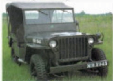
1945 Military Model MB

It continues nobly today, exemplified in the rugged, dependable Jeep® CJ-5 Renegade incorporating 43 years of technological improvements in 4WD systems design and engineering.