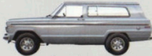
Cherokee Pioneer 2-Door