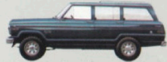
Cherokee Pioneer 4-Door